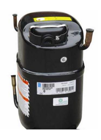
France Tecumseh compressor